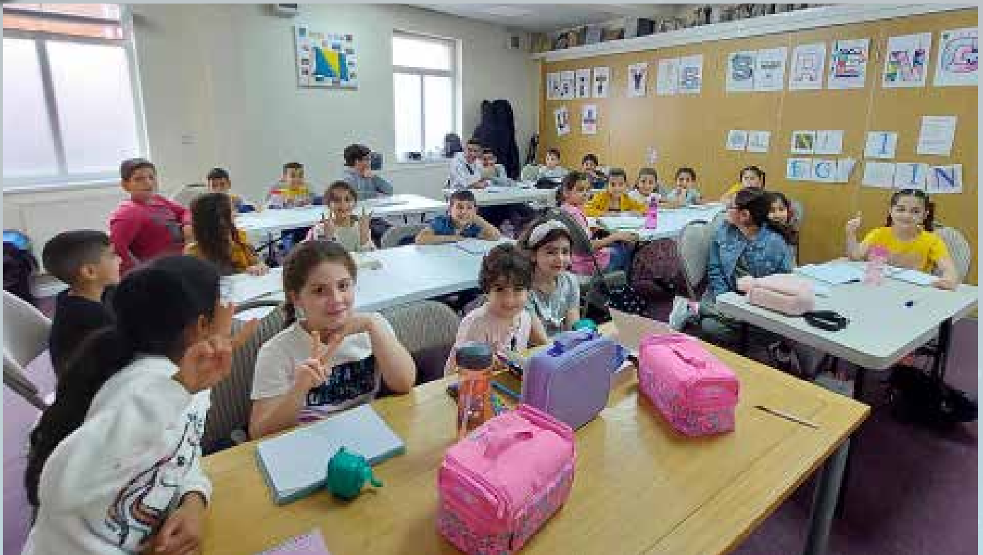
Syrian Supplementary school in Bosnia House

activities as soon as lockdown restrictions stopped. All activities were set up and delivered with strong contributions from our volunteers that were recruited from our community, the majority of them being users of our service users.