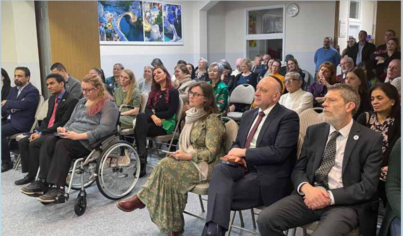
Remembering Srebrenica Awards dinner organised in the Bosnia House

We also ran many highly attended sports and cultural events aimed at maintaining engagement in our community. Our work gets strong recognition.