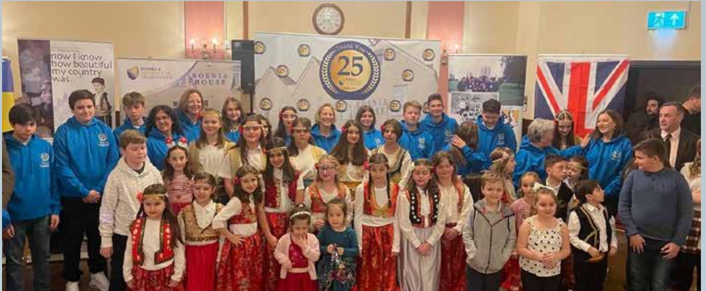
Participants of the programme celebrating Statehood Day of Bosnia and Herzegovina

The BH UK Network celebrated twenty five years of operation during this last financial period. The issues for Bosnian Refugees have obviously changed immensely during this time.