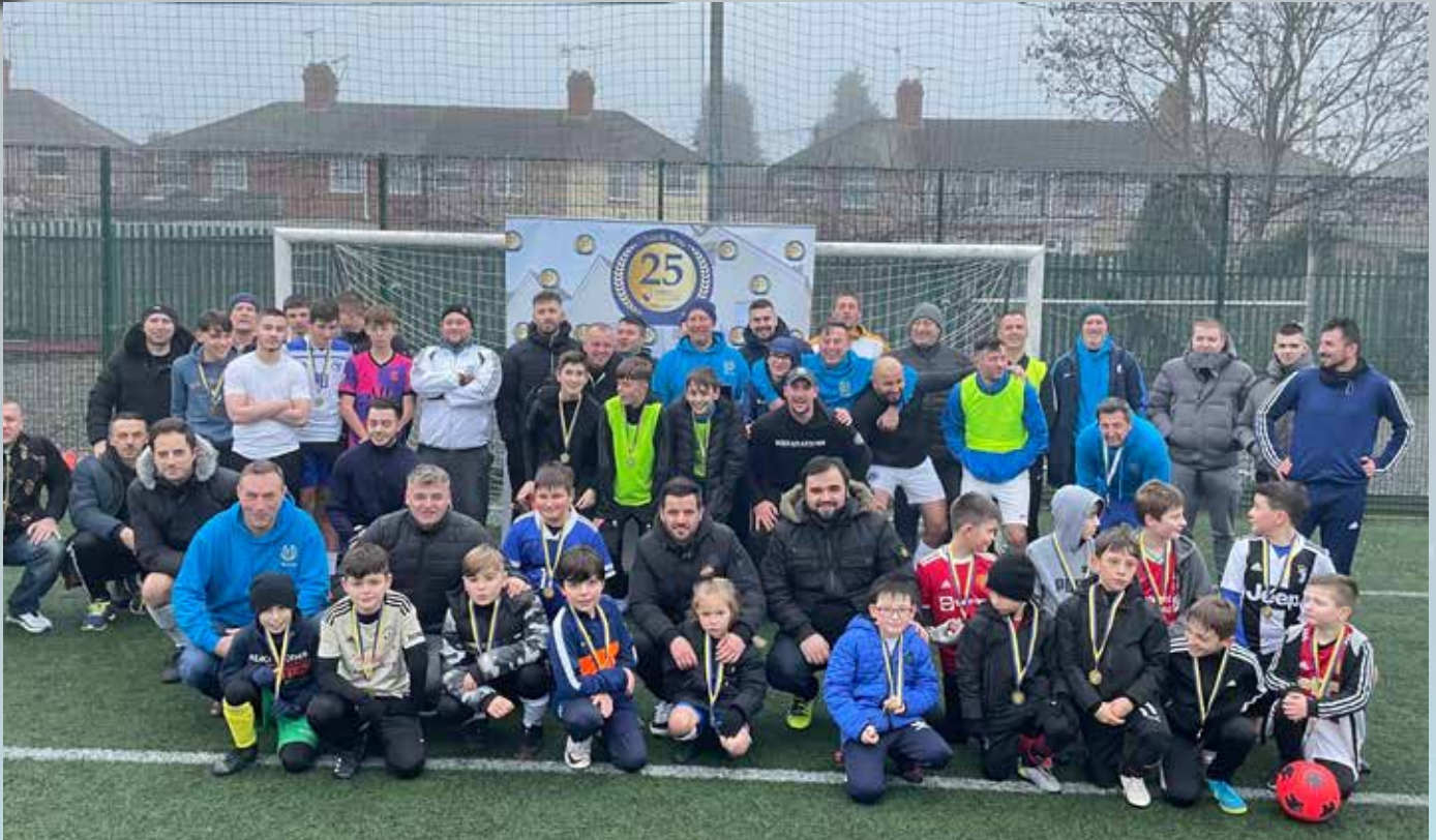
Sports gathering in Coventry

vide a telephone support line which is provides both first stage immigration and benefits information but also a 'listening ear' for community members. We anticipate the Syrian Community will need to set up similar support and our Syrian development workers are now taking a strong lead on empowering their community.