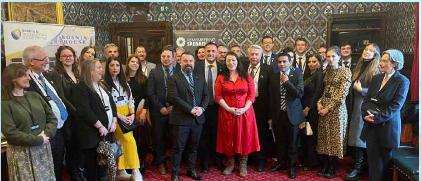
Independence day of Bosnia and Herzegovina celebrated in the British Parliament

On a more positive note we have also been raising the aspirations of young second generation Bosnians by taking them to Parliament for activities such as Bosnian Independence Day at the beginning of March. During the period, in collaboration with Remember Srebrenica, we organised many events in schools across the Midlands to raise understanding about the Srebrenica and to get people to commit to challenging genocide wherever it happens.