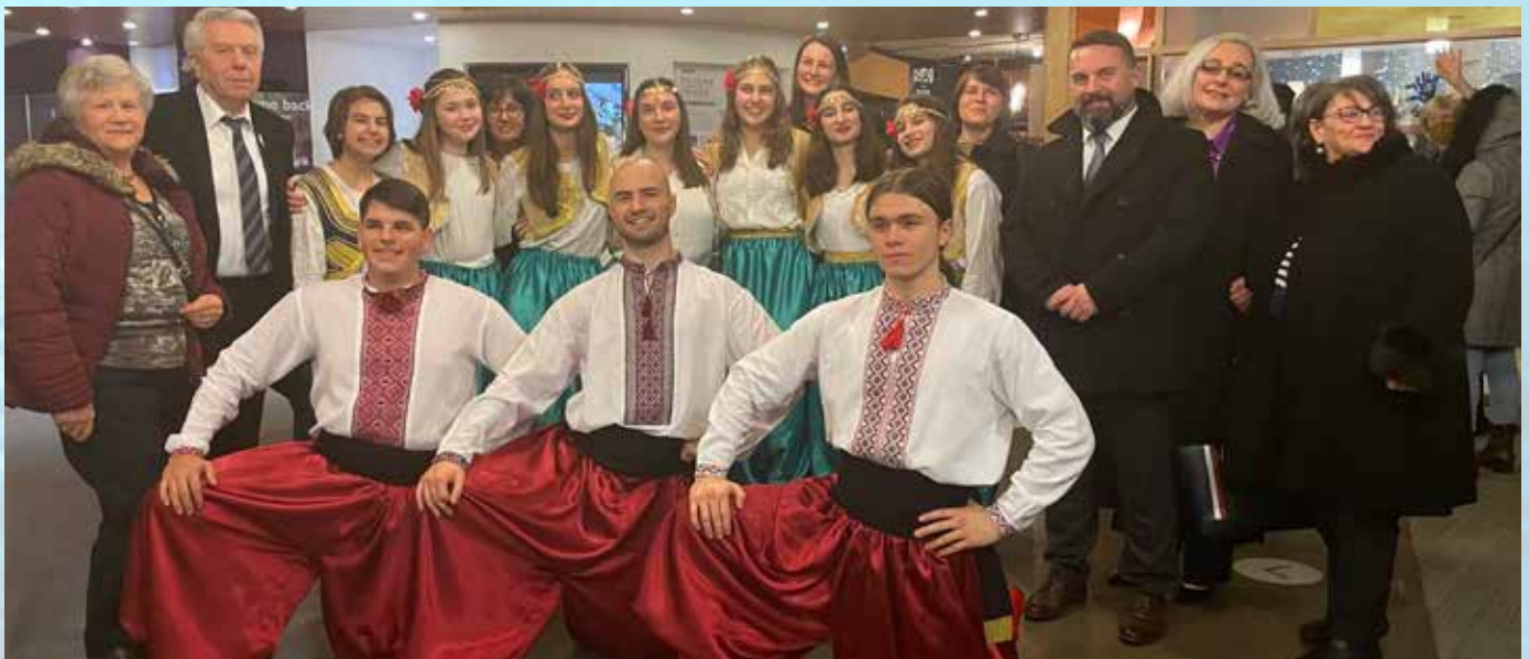
Holocaust Remembrance Day in Derby

Our West Midlands project funded by the Big Lottery Community Fund is working beyond expectations to bring positive change in the lives of Bosnians and Herzegovinians in the UK. There are 2 staff members who are available 24/7 and offer free, independent services. We started organising