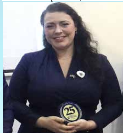
Alicia Kearns MP